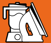
Small domestic appliances