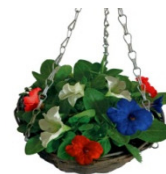
Sold 25,000 Jubilee baskets