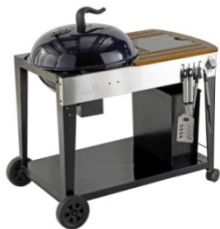
BBQ's down 8% YOY