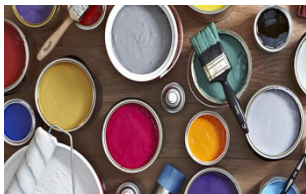
Sales of decorative paint up 15% YOY