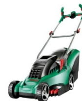
Garden Mowers Up 13% YOY