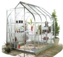
Greenhouses down 25% YOY