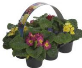
Plant sales down 20% YOY Profits down 30% YOY