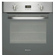
Self cleaning ovens up 45% YOY & Visor hoods up 36% YOY