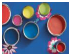
Classic red paint up 26% YOY and Electric blue paint up 41% YOY

HOW WE CELEBRATED THE JUBILEE & OLYMPICS