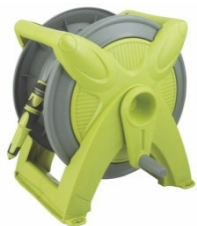
Hosepipes down 25% YOY