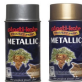
Gold spray paint up 25% YOY & Silver 18% up YOY